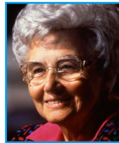
Chiara Lubich, Naples, May 3, 1996, To the Community of Naples

You show that you are pure, that you are a pure Gen, while you know that others have been influenced by a hedonistic mentality, by many ugly things.