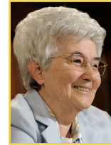
Chiara Lubich, Rocca di Papa, June 20, 1975, Gen 3 Congress, The Beatitudes

With all the violence, kidnapping, and terrorist crimes committed even by young people, which we hear about each day on television, we Gen feel it's necessary to take a decisive stand in the opposite direction: like the meek that Jesus speaks about. These meek people, even when someone does them wrong, don't let themselves get carried away by anger, don't try at once to get revenge, but they overcome evil with good.