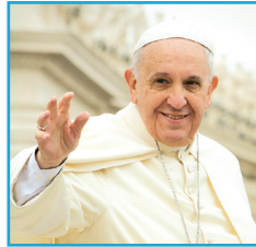
Apostolic Exhortation Gaudete et Exsultate Pope Francis paragraphs 71 to 74

These are strong words in a world that from the beginning has been a place of conflict, disputes and enmity on all sides, where we constantly pigeonhole others on the basis of their ideas, their customs and even their way of speaking or dressing. Ultimately, it is the reign of pride and vanity, where each person thinks he or she has the right to dominate others. Nonetheless, impossible as it may seem, Jesus proposes a different way of doing things: the way of meekness. This is what we see him doing with his disciples. It is what we contemplate on his entrance to Jerusalem: «Behold, your king is coming to you,